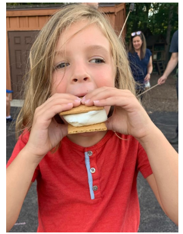
Blessing of the Backpacks