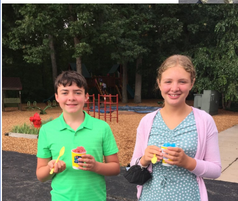
Kona Ice Truck