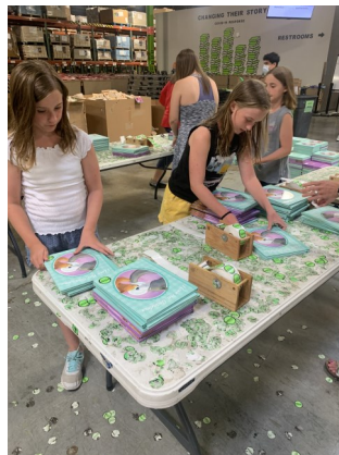
Thanks to the volunteers at Bernie's Book Bank